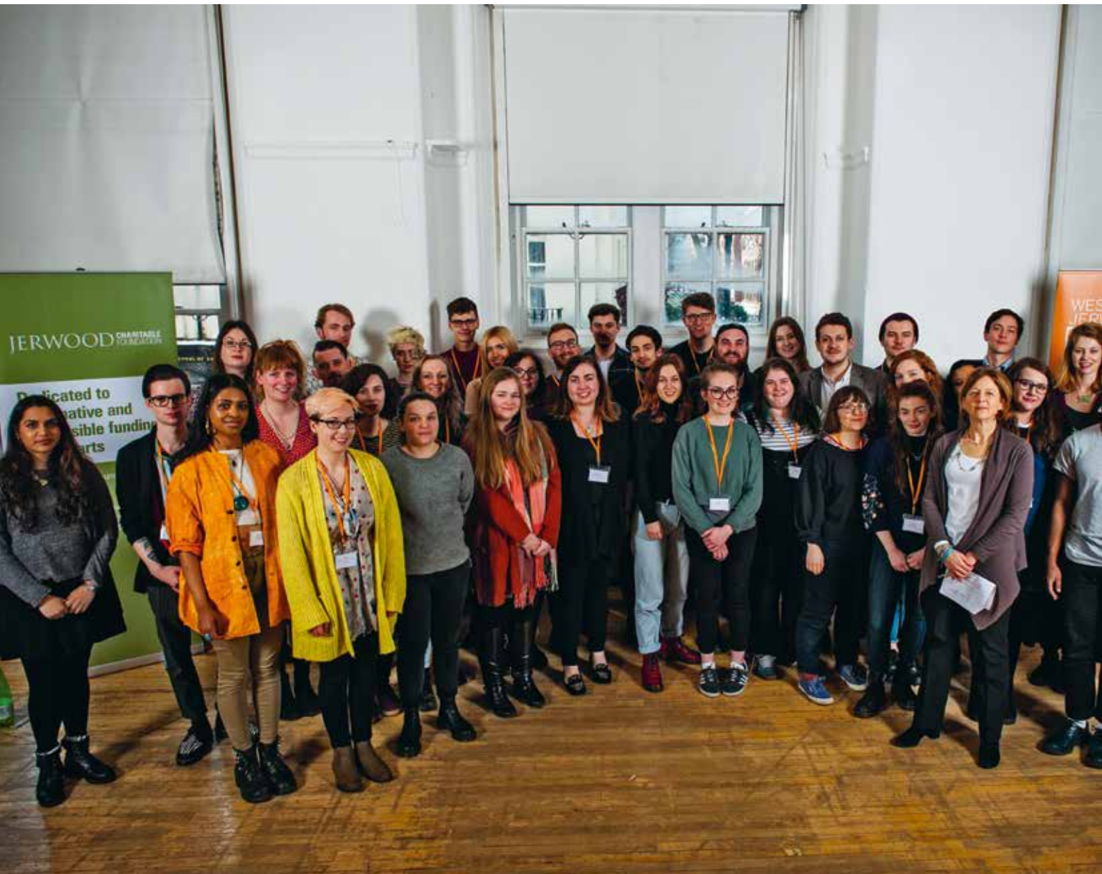
Weston Jerwood Creative Bursaries, 2017-19